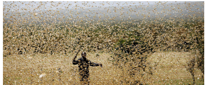
A man attempts to fend-off a swarm of desert locusts at a ranch near the town of Nanyuki in Laikipia county, Kenya, February 21, 2020.

Membership to the RTWGAA is voluntary. The RTWGAA constitute members drawn from organizations who have technical expertise, experience and interest in Anticipatory Action and Disaster risk management within Eastern Africa. The chairs and focal points from National TWG are also members of RTWGAA. The working group will endeavour to foster partnership with other related working groups within and outside Eastern Africa.