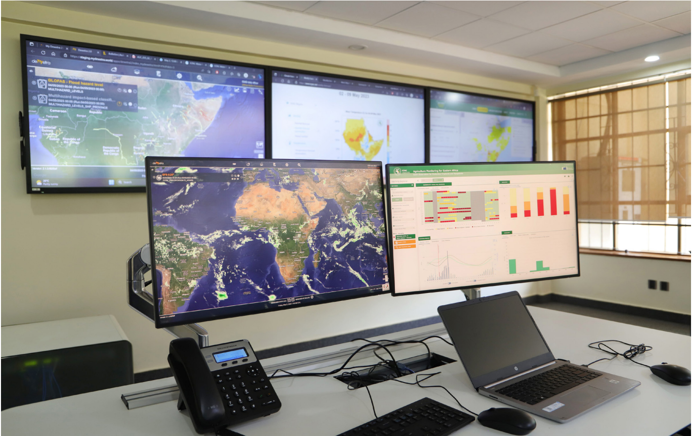
Computer monitors displaying DEWETRA and the East Africa Hazards Watch apps showcasing real-time monitoring and forecasting of natural hazards like floods, landslides, drought, cyclones, pests (desert locust), heavy rainfall, floods, and crop failures, which are increasing in frequency and intensity due to climate change, at the Disaster Operations Center (DOC) at ICPAC Head offices in Nairobi, Kenya