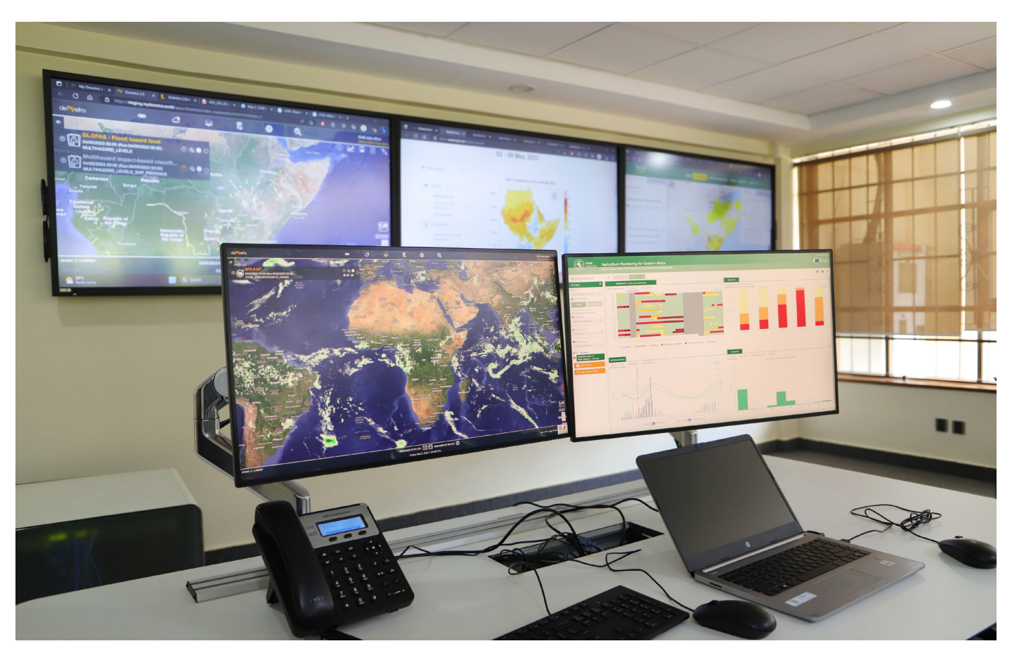
Computer monitors displaying DEWETRA and the East Africa Hazards Watch apps showcasing real-time monitoring and forecasting of natural hazards like floods, landslides, drought, cyclones, pests (desert locust), heavy rainfall, floods, and crop failures, which are increasing in frequency and intensity due to climate change, at the Disaster Operations Center (DOC) at ICPAC Head offices in Nairobi, Kenya