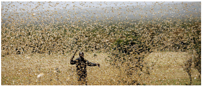
A man attempts to fend-off a swarm of desert locusts at a ranch near the town of Nanyuki in Laikipia county, Kenya, February 21, 2020.

Membership to the RTWGAA is voluntary. The RTWGAA constitute members drawn from organizations who have technical expertise, experience and interest in Anticipatory Action and Disaster risk management within Eastern Africa. The chairs and focal points from National TWG are also members of RTWGAA. The working group will endeavour to foster partnership with other related working groups within and outside Eastern Africa.