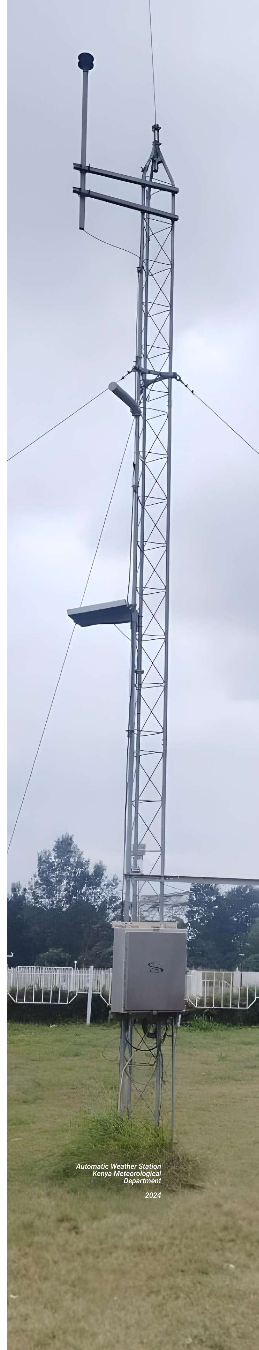
Automatic Weather Station Kenya Meteorological Department 2024

The Kenya Anticipatory Action Road map is informed by the priorities of Sendai Framework for Disaster Risk Reduction (2015-2030) the global pillars of the Early Warning for All (EW4ALL) initiative (2022-2027), the Africa Program of Action (2015-2030), the Africa Union Agenda 2063, and the IGAD Regional Roadmap for Anticipatory Action (2023-2027). These seven pillars seek to contribute to the implementation of solutions to challenges impacting the adoption and utilization of anticipatory actions across the country.